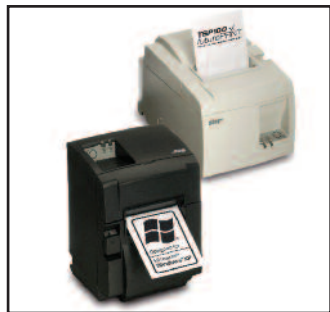
Gray & Putty